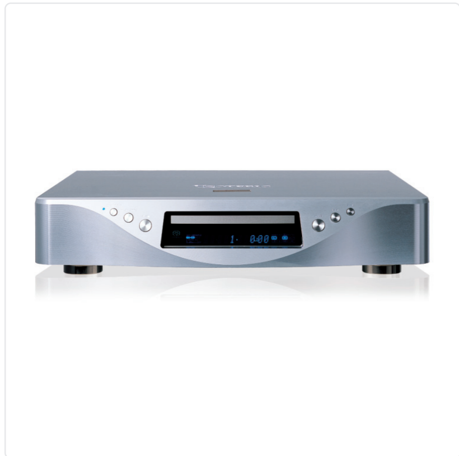
SUPER AUDIO CD/CD PLAYER MODEL SZ-1

High musicality in a sophisticated new presence! SUPER AUDIO CD / CD player designed for high-end digital source playback.