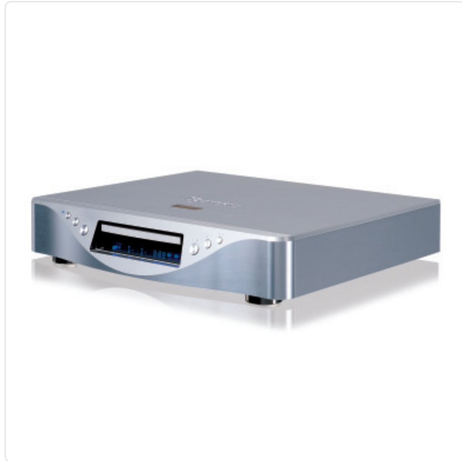
SUPER AUDIO CD/CD/DVD UNIVERSAL PLAYER MODEL UZ-1

Beautiful conformity to audio and video elegance! SUPER AUDIO CD/CD/DVD universal disc player.