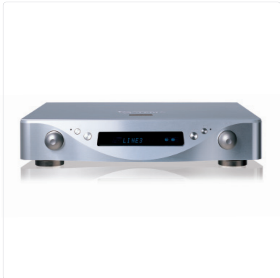
DIGITAL INTEGRATED CLASS "D" AMPLIFIER AND MASTER CLOCK SIGNAL GENERATOR MODEL AZ-1

An amplifier and master clock signal generator designed for high-end audio video.